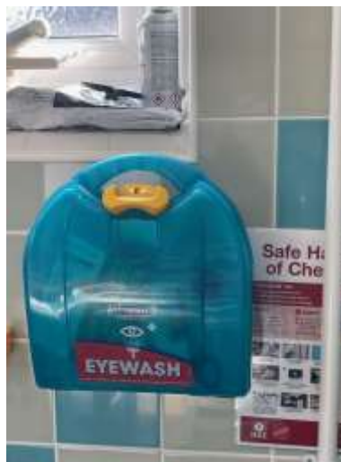
RGE hygiene room